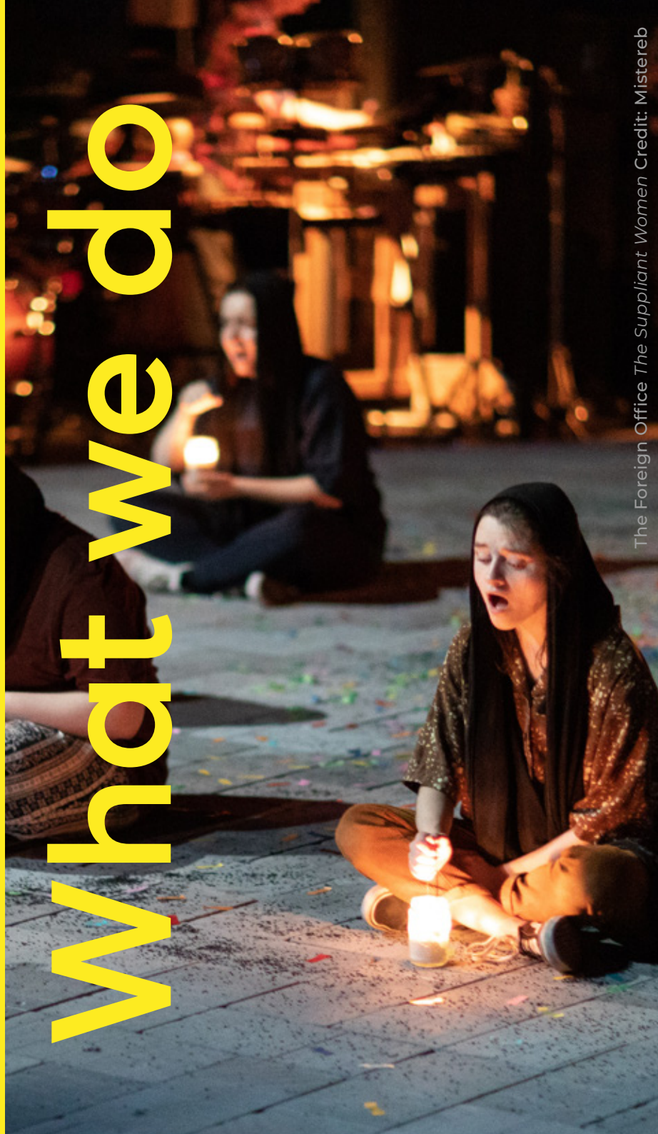
The Foreign Office The Suppliant Women

Docking Station – when completed in 2025 this digital state-of-the-art creative space in Medway will house iCCI.